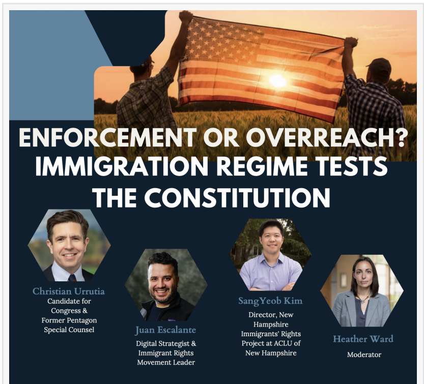
HLLSA event poster