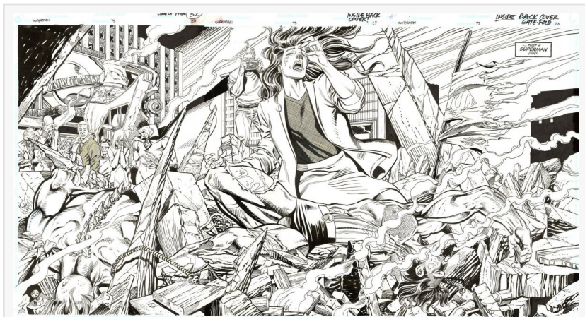
artwork from Death of Superman

media frenzy and forever altered the landscape of modern comics. The artwork showcases Jurgens' dynamic storytelling, from heart-pounding action sequences to poignant emotional beats, culminating in Superman's sacrificial stand against an unstoppable foe.