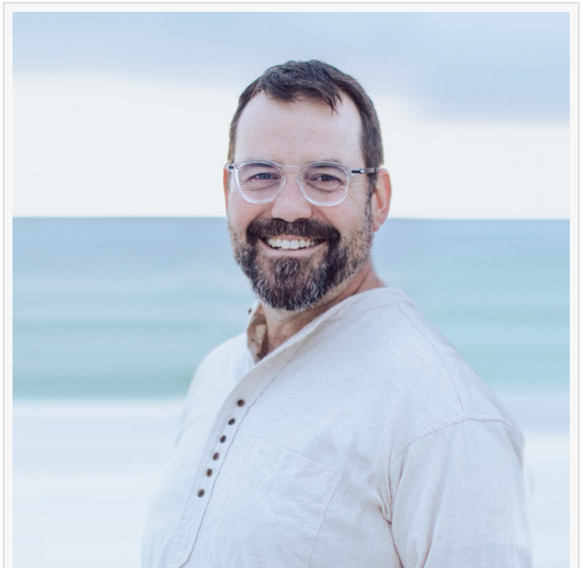
Acclaimed Author, R L Akers

This press release can be viewed online at: https://www.einpresswire.com/article/899825199