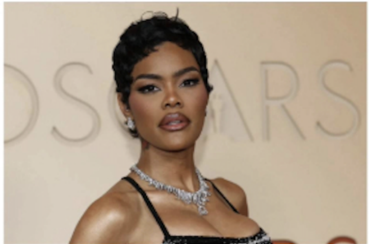
Teyana Taylor attends the 98th Annual Academy Awards.