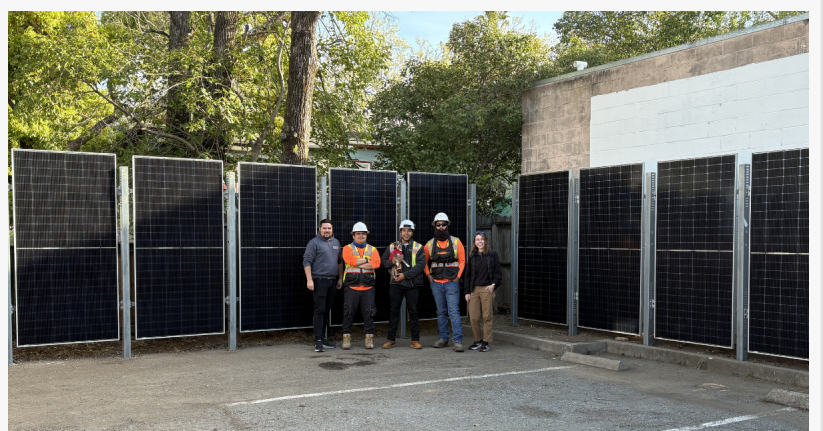
Finished Urban Vertical Fence at Bodhi Yoga

SAN RAFAEL, CA, UNITED STATES, April 7, 2026 /EINPresswire.com/ -- Bodhi Hot Yoga and Fitness, a family-owned studio in downtown San Rafael, has partnered with renewable energy innovator Sunzaun to install what is believed to be the first vertical bifacial solar installation in an urban environment in the United States.