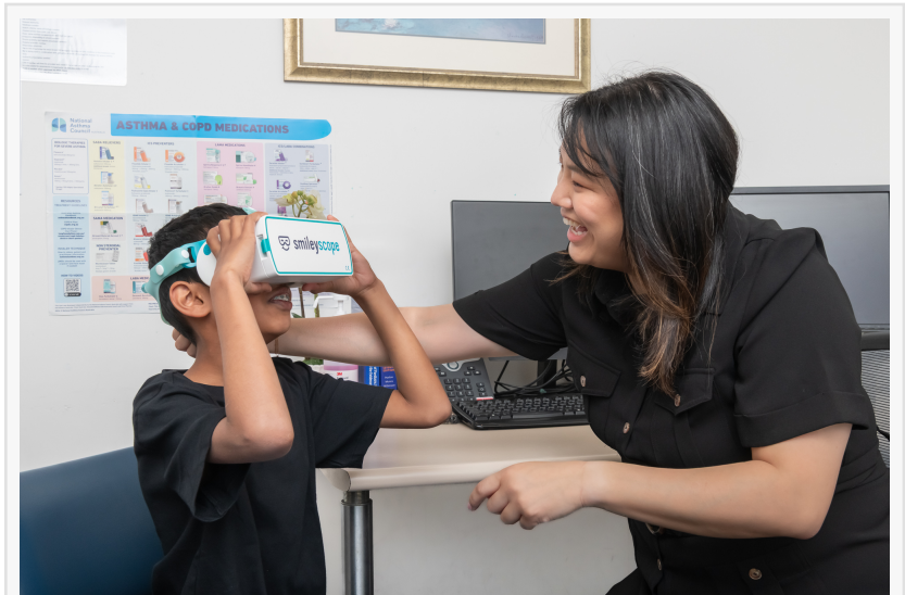
Paediatric clinician improving procedures with Smileyscope Digital Analgesic

As adoption continues to grow worldwide, Smileyscope is helping healthcare systems unlock a new standard of care - improving outcomes, elevating patient experience, and delivering meaningful operational and financial value.