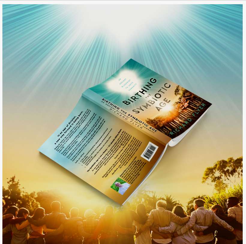
Birthing the Symbiotic Age Book Mockup: A Beacon of Unity and Renewal