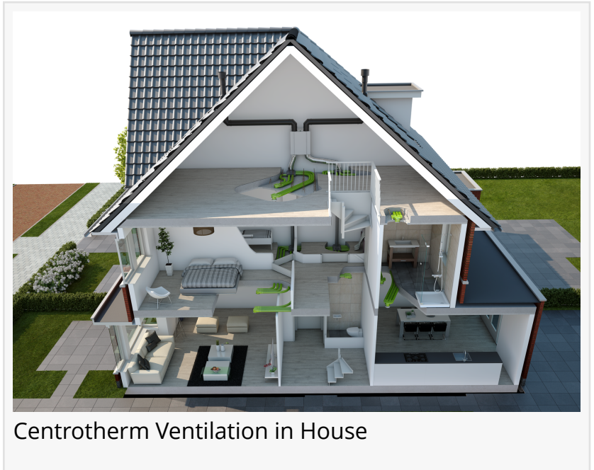
Centrotherm Ventilation in House

WATERFORD, NY, UNITED STATES, March 17, 2026 /EINPresswire.com/ -- Centrotherm Canada is proud to announce the rebranding of its Air Excellent product line as Centrotherm Ventilation . This strategic move marks a significant collaboration between Centrotherm and its sister company, Ubbink, combining decades of expertise in ventilation technology and air management to provide state-of-the-art solutions for residential and commercial buildings in Canada.