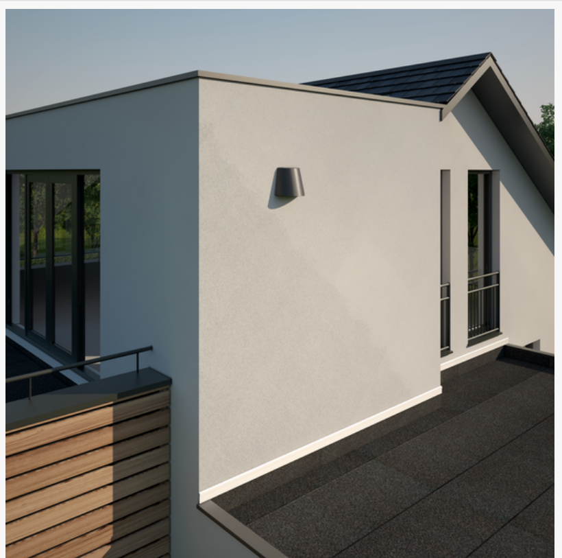
Contego Wall Terminal