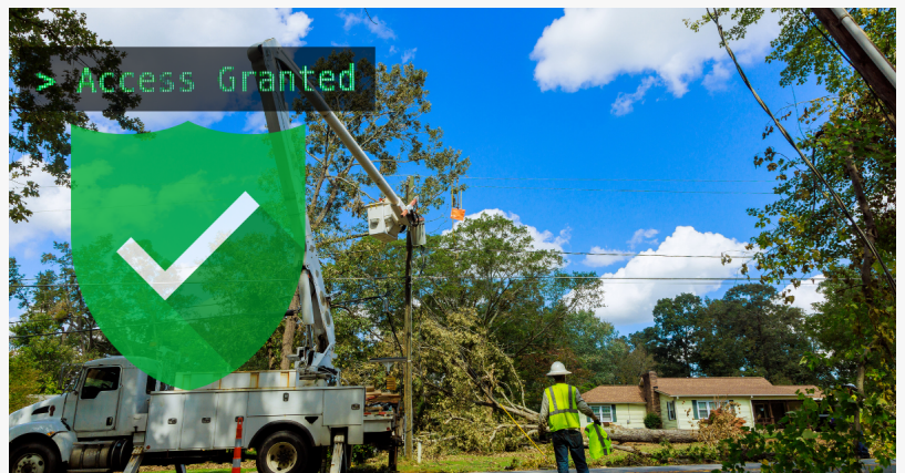
Access Granted for BOSS811 Dig™ Utility Locate Ticket Management Software

/EINPresswire.com/ -- BOSS Solutions, a provider of software for damage prevention and one-call locate ticket management, today announced the early access program for BOSS811 Dig™ , a new utility locate ticket management solution designed specifically for excavators and contractors. The program invites industry professionals to preview and provide feedback on the platform before its full commercial release.