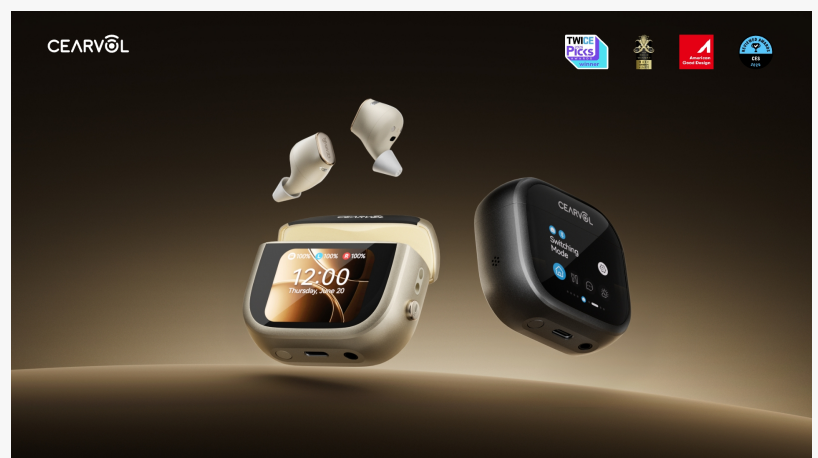
cearvol wave hearing aids (main)

Moreover, Wave was also acknowledged as a honoree at the Best of CES Awards 2026 by Gadgety, cementing its reputation as a leading choice in hearing solutions.