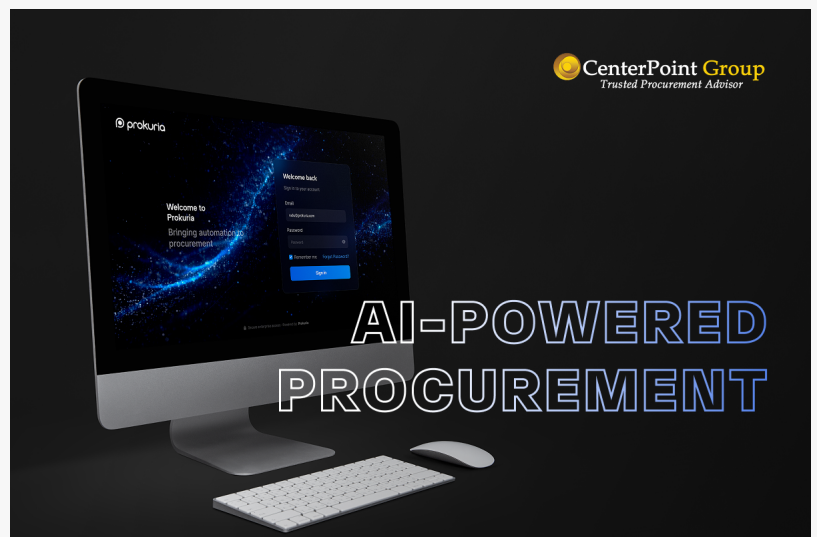
AI Powered Procurement by CenterPoint Group and Prokuria