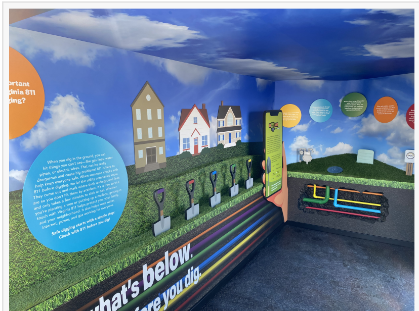
Children explore the interactive activity wall inside Virginia 811's Dig Smart Mobile Learning Center, learning how to dig safely.