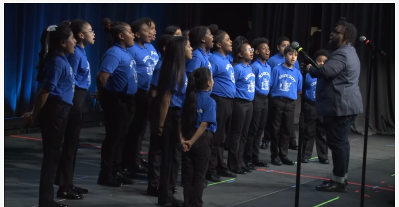
ETM students return for the second year to perform the National Anthem at the legendary Inner Circle Show on March 28, 2026.