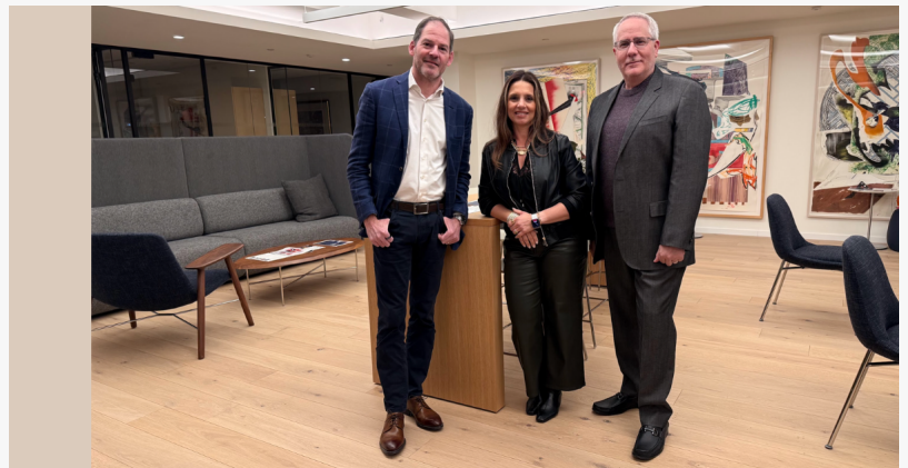
As a precursor to the spring gala, ETM recently held an intimate "Meet the Honorees Night" at the offices of Rosenthal Capital Group.