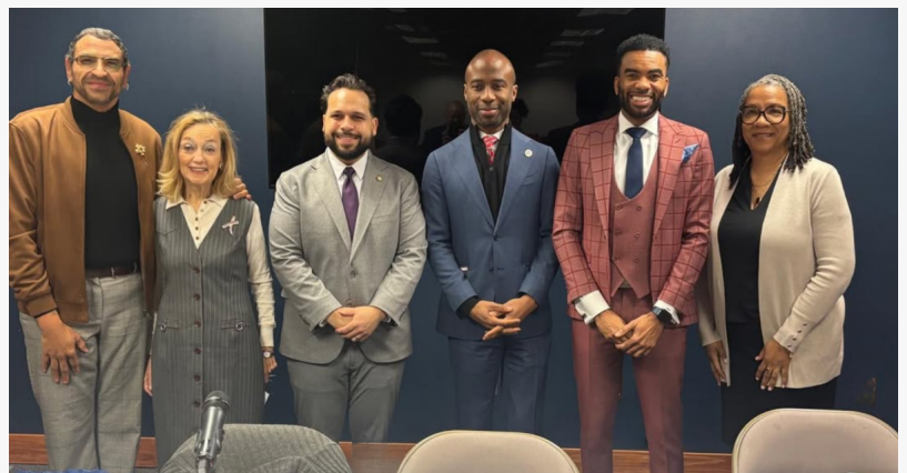
ETM expands its advocacy at the Albany Caucus Weekend, leading the "Building the Arts Education Workforce" workshop.

On March 28, 2026, ETM students will return to the spotlight to perform the National Anthem at the legendary Inner Circle Show. This marks the second consecutive year that ETM students have been invited to participate in this storied New York City tradition which is a political roast of the Mayor that has been a city staple since 1923. Performing for an audience of