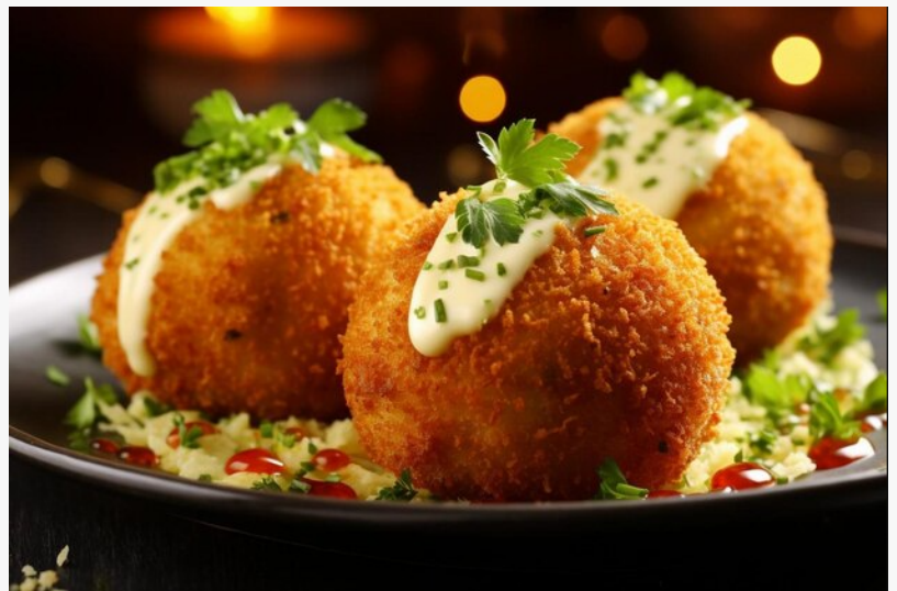
Crispy Italian arancini balls served at a Supper at Home private home dining event