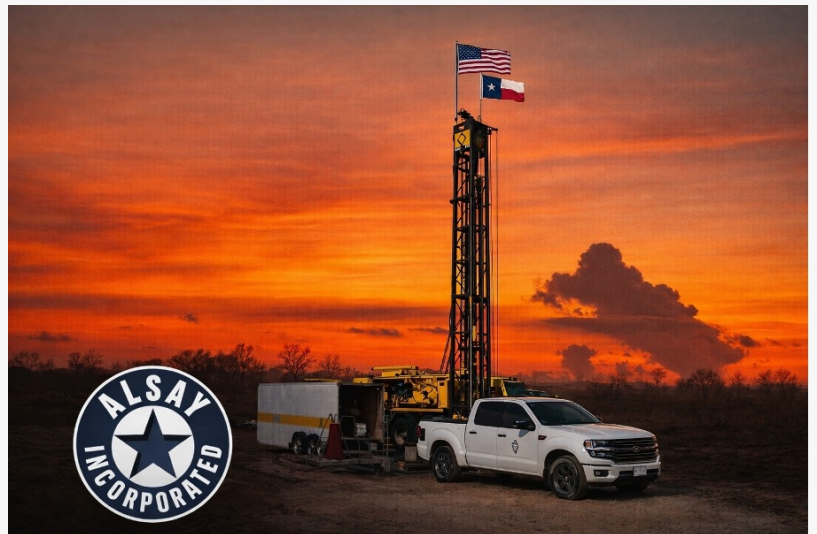
Alsay Inc. drilling operations in the field, reflecting the company's commitment to precision, reliability, and community impact.