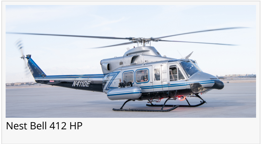
Nest Bell 412 HP

ALBUQUERQUE, NM, UNITED STATES, March 24, 2026 /EINPresswire.com/ -- The National Museum of Nuclear Science & History is proud to announce the latest addition to its aviation and history exhibits: the Bell 412 HP Helicopter, a veteran of the U.S. Department of Energy (DOE)'s Nuclear Emergency Support Team (NEST). This historic aircraft, registration number N411DE, arrives as a significant donation from the DOE's National Nuclear Security Administration (NNSA).