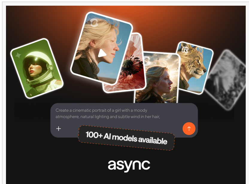
Async Adds 100+ AI Models

Beyond generation, Async introduces a chat-based editing experience. The platform enables continuous refinement through conversation. Users can tweak timing, adjust visuals, layer effects, and polish their video — all within the same chat interface, combining the power of multiple AI models without switching tools or re-uploading files