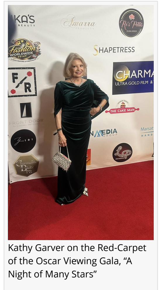
Kathy Garver on the Red-Carpet of the Oscar Viewing Gala, "A Night of Many Stars"

Kathy's timeless talent, versatility, and enduring presence have solidified her status as a cherished figure in Hollywood history.