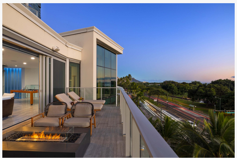
Sweeping Ocean and Skyline Views Across Every Level

Concierge Auctions is the world's largest luxury real estate auction house, with a state-of-the-art digital marketing, property preview, and bidding platform. The firm matches sellers of one-of-a-kind homes with some of the most capable property connoisseurs on the planet. Sellers gain unmatched reach, speed, and certainty. Buyers receive curated opportunities. Agents earn their commission in 30 days. Majority owned by Sotheby's, the world's premier destination for fine art and luxury goods, and Compass (NYSE: COMP), Concierge Auctions continues to operate independently, partnering with real estate agents affiliated with many of the industry's leading brokerages to host luxury auctions for clients. Still run by our co-founder, our platform is