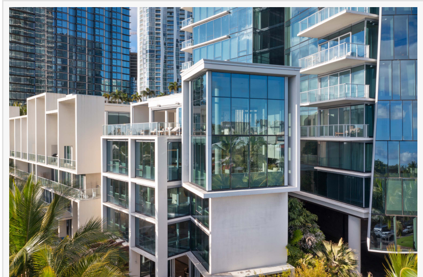
Private Five-Level Villa with Pool at Waiea, Honolulu's Finest Address

NEW YORK, NY, UNITED STATES, March 23, 2026 /EINPresswire.com/ -- A one of one Honolulu residence spanning five levels of luxury at one of Honolulu's most coveted addresses will sell at auction via Concierge Auctions . Custom-crafted with a private pool, resort-style amenities, four rare parking spaces, and Pacific Ocean views from every level, 'Villa One at Waiea', located at 1118 Ala Moana Boulevard Villa 1 , is the firm's latest offering within its Developer Services Division.