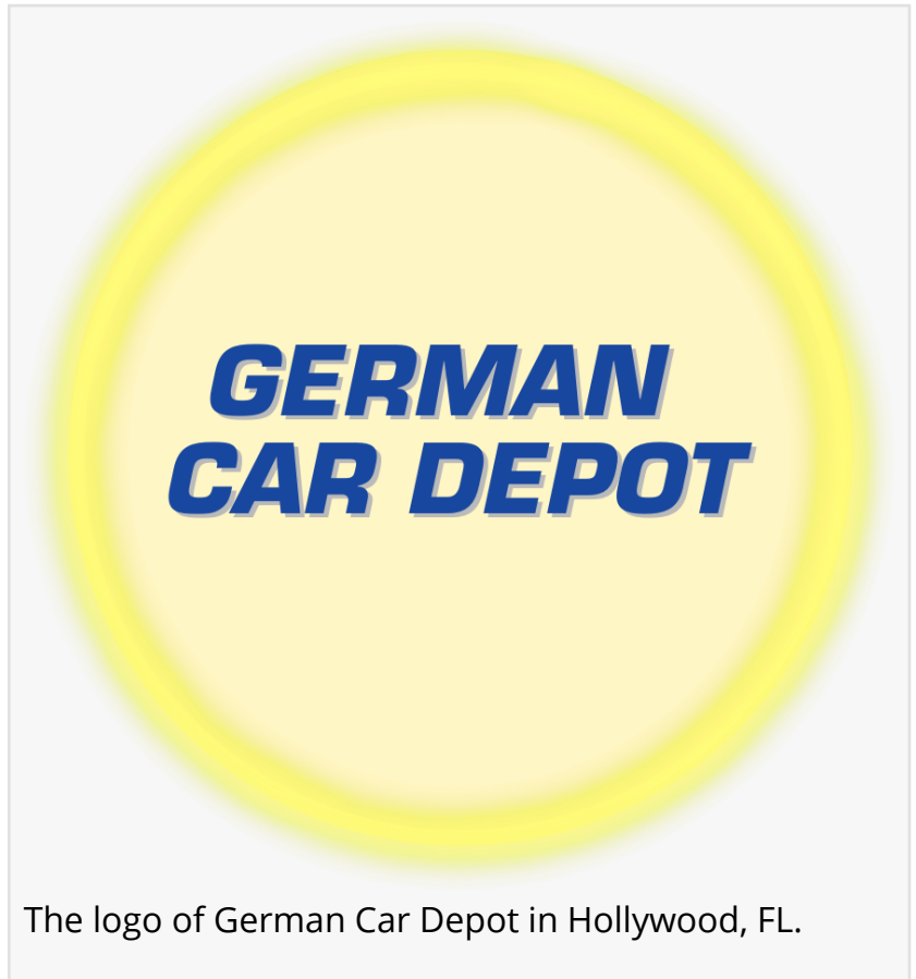
The logo of German Car Depot in Hollywood, FL.

What Are the Most Common Land Rover Warning Signs?