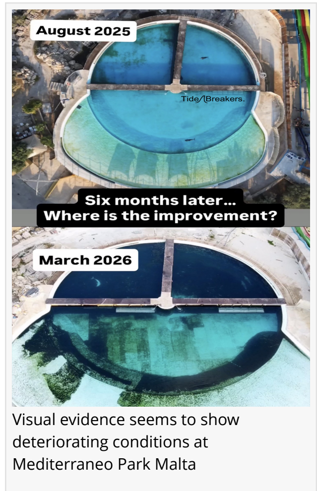
Visual evidence seems to show deteriorating conditions at Mediterraneo Park Malta

About TideBreakers: TideBreakers is a Canadian nonprofit organization focused on marine mammal welfare. Its work includes research, public education, and advocacy related to captive marine animals and long-term care solutions