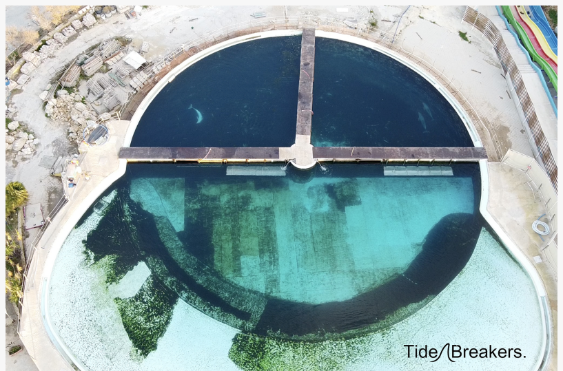
Dolphins in documented shallow tanks at the park