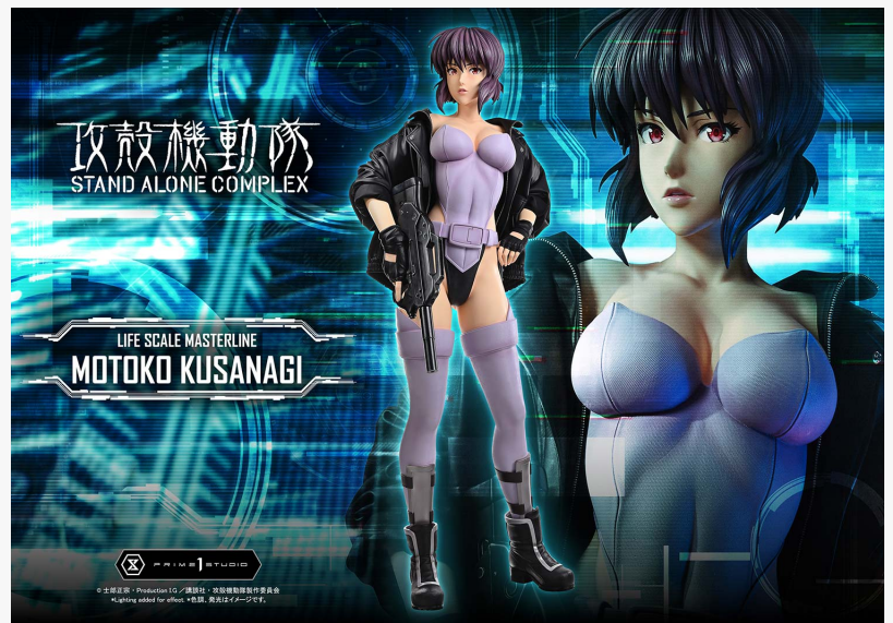
Life Scale Masterline GHOST IN THE SHELL STAND ALONE COMPLEX MOTOKO KUSANAGI

The head sculpt features crimson camera eyes with visible internal markings, short hair that falls diagonally forward, and a firm facial expression. Her supple proportions are reproduced with attention to detail, and the Seburo C-26A in her right hand is finished with precise mechanical detailing.