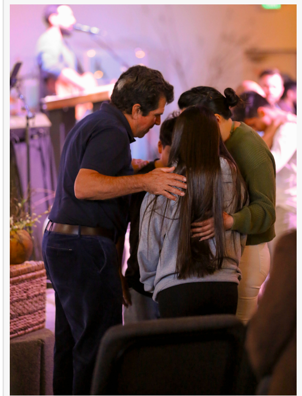
A pastor prays with members of the congregation during a Sunday service at Calvary Chapel The Rock, a Calvary Chapel church located in Santa Rosa, Sonoma County, California.