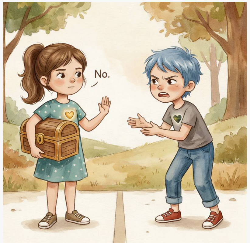
Roan Miles Mandys Gold Pic 3