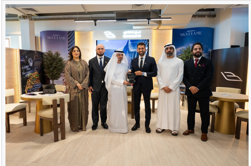
The Binghatti team marks the successful DPS Launch event this March 25, showcasing the latest milestones for the "Binghatti" project.

Footfall on the opening day far exceeded expectations. Hundreds of visitors, including serious buyers, investors, brokers, and curious first-