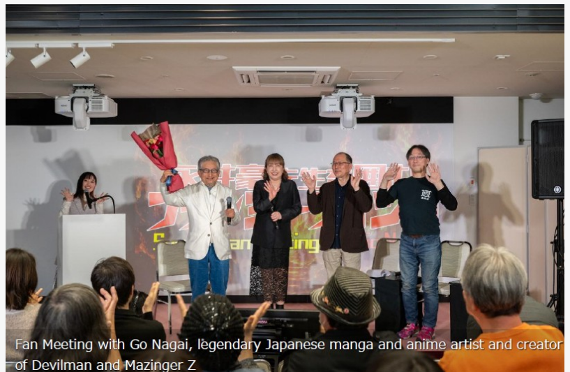
Fan Meeting with Go Nagai, legendary Japanese manga and anime artist and creator of Devilman and Mazinger Z

One of the venues of Tokyo Anime Award Festival 2026: TOHO CINEMAS Ikebukuro