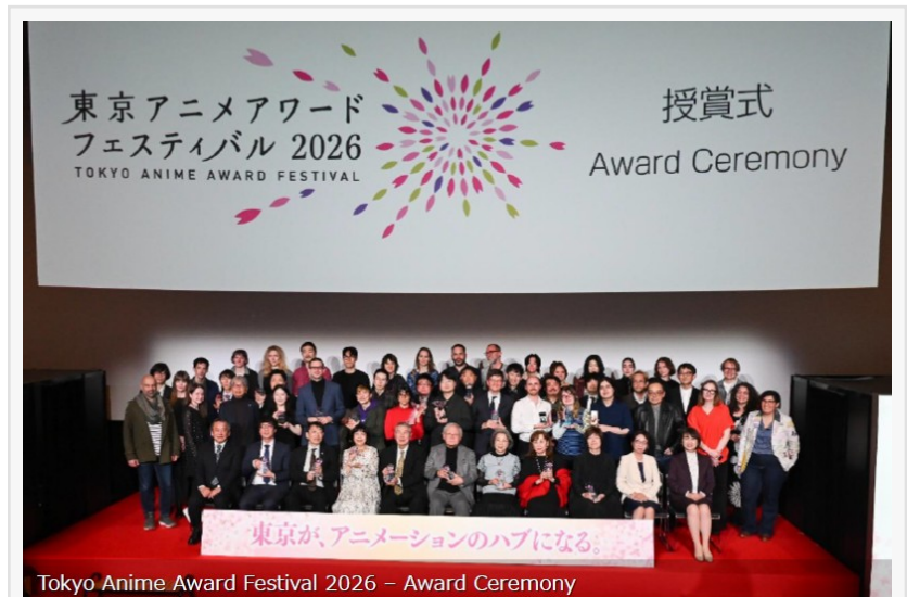
Tokyo Anime Award Festival 2026 – Award Ceremony

The festival's competition section was diverse and vibrant with the Feature Animation Grand