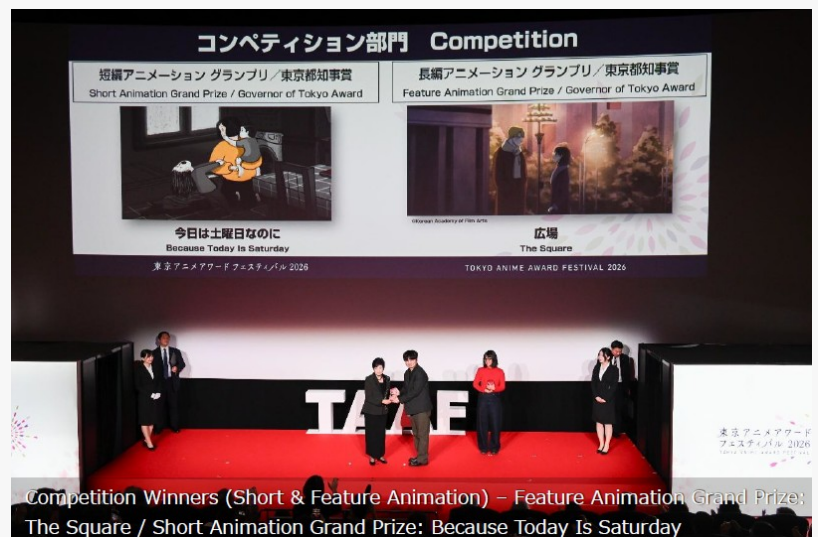
Competition Winners (Short & Feature Animation) – Feature Animation Grand Prize: The Square / Short Animation Grand Prize: Because Today Is Saturday