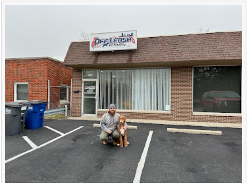
Proud training moment at Off Leash K9 Training Toledo.

TOLEDO, OH, UNITED STATES, March 27, 2026 /EINPresswire.com/ -- Off Leash K9 Training Toledo is putting the spotlight on its 2-Week Board and Train program, a structured training option for owners who want practical obedience and better day-to-day control with their dogs. The program includes two weeks of immersive work with a professional trainer and is available for dogs 6 months or older.