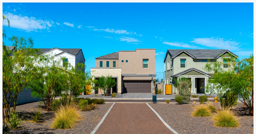
Homes in Gilbert, Arizona — Doorya buys houses across the Phoenix metro for cash, with offers in 24 hours and closings in as few as seven days.

GILBERT, AZ, UNITED STATES, March 30, 2026 /EINPresswire.com/ -- Doorya, a locally owned cash home buying company, today announced the launch of its home purchasing service for homeowners across the Phoenix metropolitan area. The company offers cash offers within 24 hours and can close in as few as seven days, with zero fees or commissions charged to sellers.