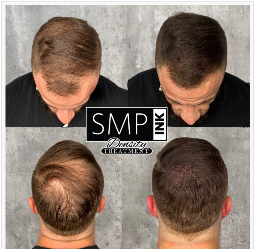
hair density treatment example with SMP INK for a Male