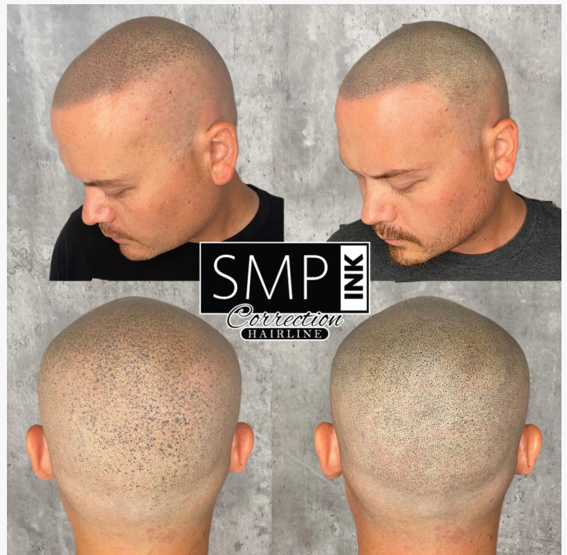
Example of SMP INK Hair line correction services