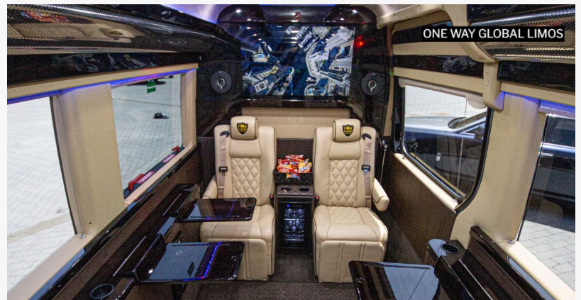
limousine rental in Miami