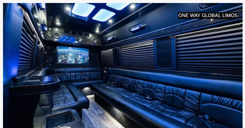
limo service in Miami

Miami continues to see steady growth in tourism, corporate activity, and social events. With this rise comes the challenge of coordinating efficient