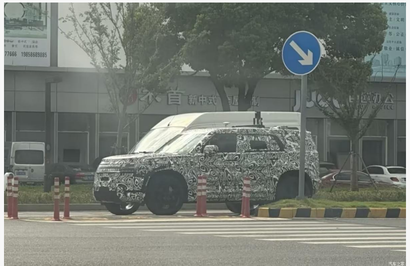
Freelander Spy Shot4