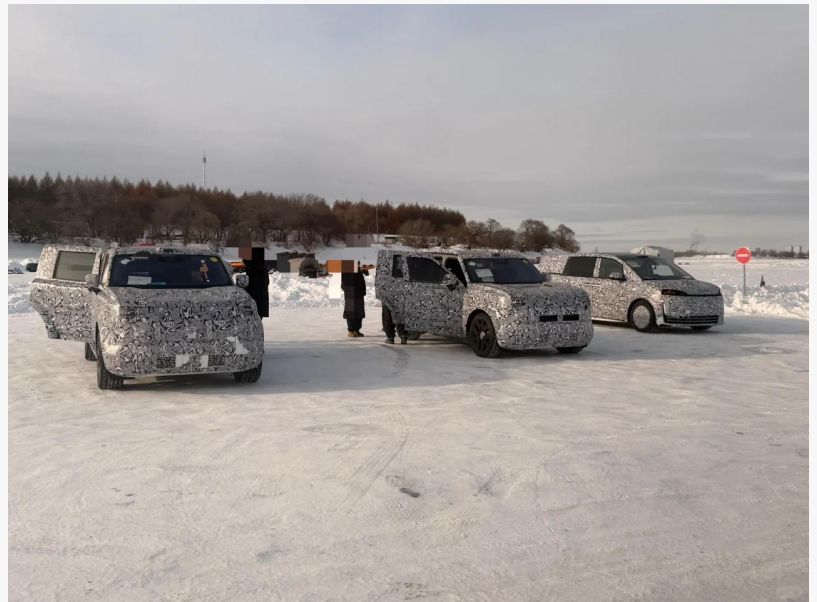
Freelander Spy Shot2