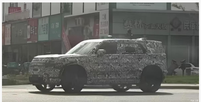
Freelander Spy Shot

This stage of development indicates a broader and more versatile positioning. The direction reflects a combination of versatility, presence, and everyday usability, while maintaining core elements historically associated with the Land Rover heritage.