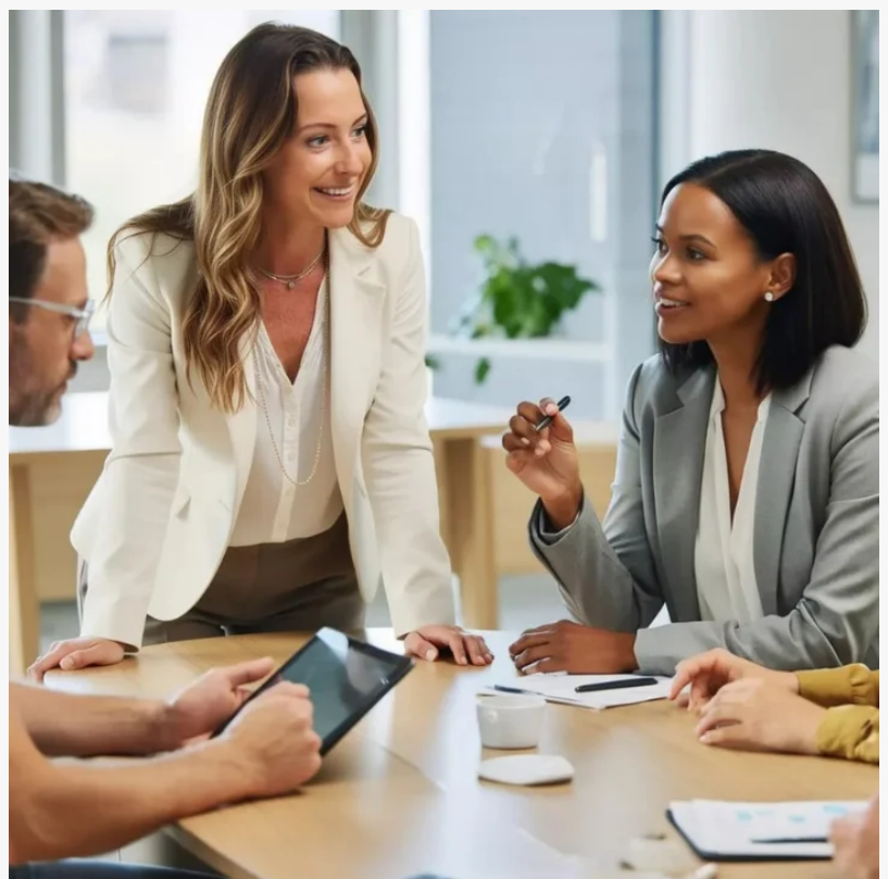
Beverly consulting executives

Glial Solutions is the leader in nervous-system-informed organizational consulting. By grounding their work in applied neuroscience, somatic training, and systems thinking, they provide the infrastructure beneath behavior that allows for sustainable performance, retention, and leadership. For more information, visit [Your Website URL].