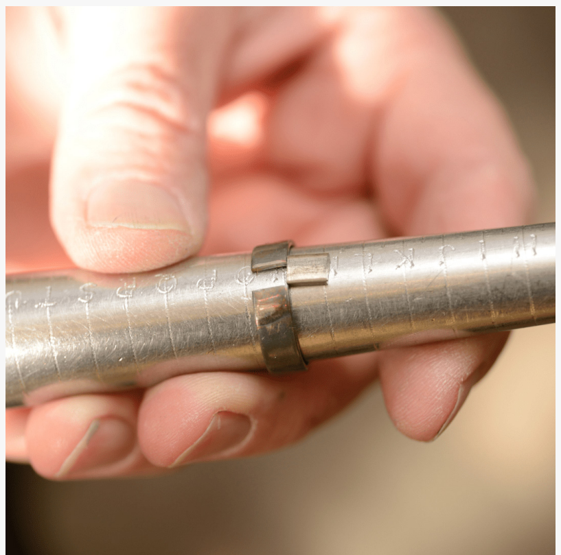
Jewelry Repair Appts