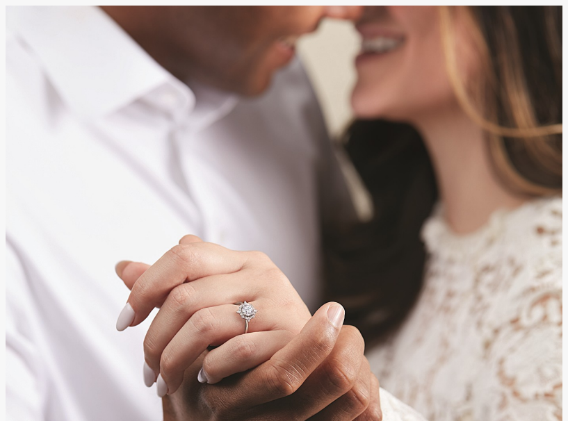
Bridal Jewelry Appts