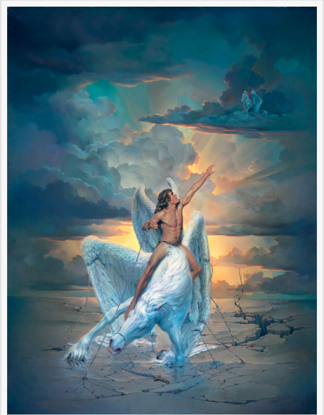
Restrictions is one of the most widely collected images in modern art history

This elevated level of service is part of the collection's soft launch and will not be offered once this introductory period ends. Collectors are encouraged to take advantage of this unique opportunity while it is available.