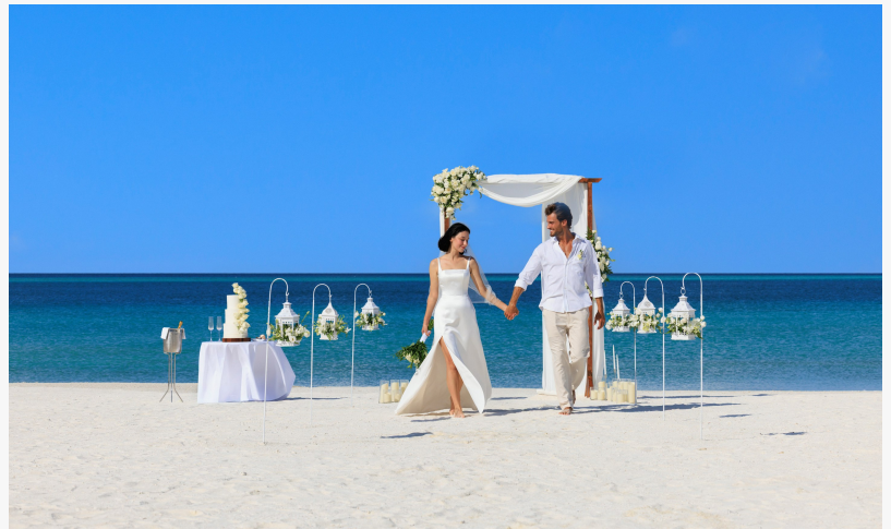
Grand Vow Renewals