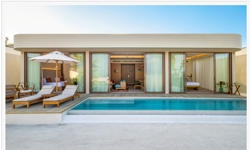
Refined Beachfront Living

The resort offers bespoke experiences for every occasion, from intimate vow renewals and celebratory milestones to group retreats and corporate gatherings. Families are catered for with a dedicated kids' club for young islanders and an E-Zone for teenagers, while a broad range of recreational activities ensures guests of all ages can engage with the island's natural beauty. Thoughtfully designed spaces provide the perfect setting for corporate events,