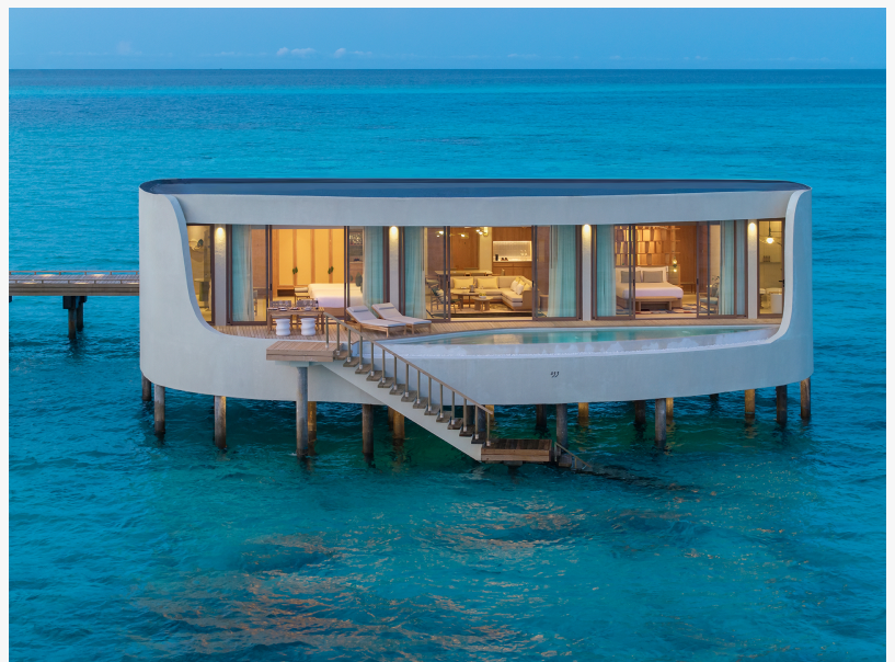
Elegant Overwater Living