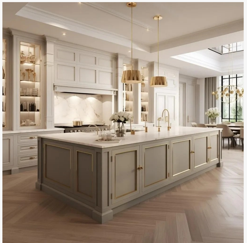
Butler Pantry & Scullery Design inspiration