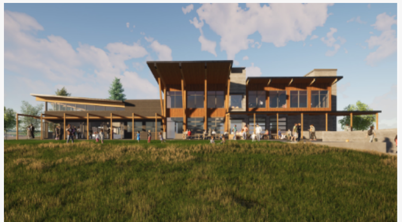
Tava House Architect Rendering (Courtesy of Echo Architecture & Interiors)

WOODLAND PARK, CO, UNITED STATES, April 2, 2026 /EINPresswire.com/ -- TAVA House is excited to announce that on Sunday, April 19, 2026, from 1:00 pm to 4:00pm, The Wedding Gathering is heading to Woodland Park for a stress-free afternoon.