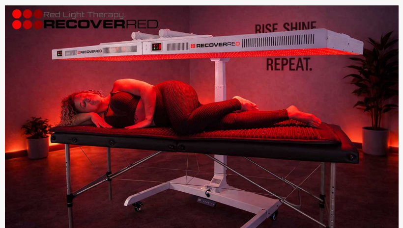
Pushing The Boundaries Of What's Possible In The World Of Cellular Health.

PITTSBURGH, PA, UNITED STATES, April 1, 2026 /EINPresswire.com/ -- Recover Red , a U.S.-based provider of red light therapy solutions, today announced its expanded focus on full-body red light therapy systems for both residential users and commercial wellness operators.