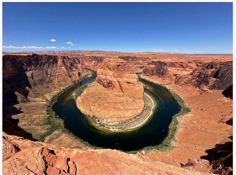
One of the Southwest's most iconic views—Horseshoe Bend curves dramatically through the desert landscape.

Beyond the canyon walls, the surrounding terrain undergoes a seasonal transformation as Arizona's native wildflowers begin to appear across the desert floor. Desert marigolds, primroses, and other spring blooms create vibrant contrasts against the region's iconic red sandstone formations, attracting photographers and nature enthusiasts alike.