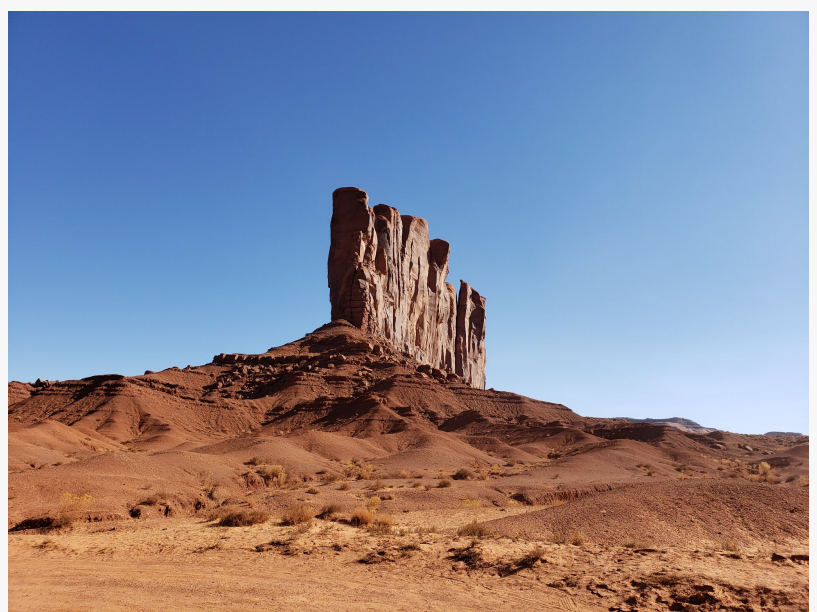
Towering sandstone buttes rise from the desert floor in the heart of Monument Valley.

Aerial sightseeing tours have also grown in popularity in recent years. Flights departing from Northern Arizona offer travelers panoramic views of the Colorado River, Lake Powell, canyon