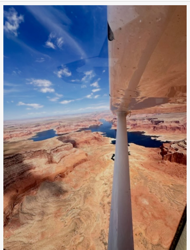
Experience Lake Powell from above—where deep blue water meets endless desert canyons.