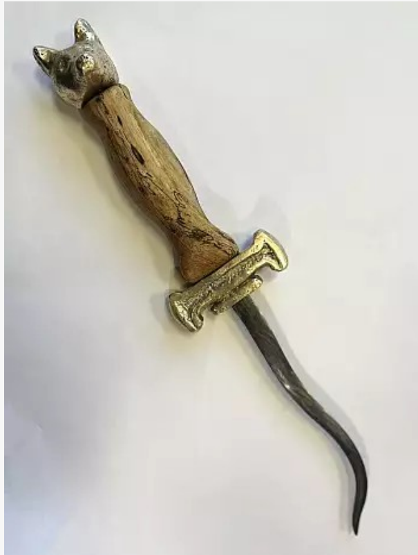
The competition group's pattern-welded, Damascus-style blade, nicknamed the "foxtail"