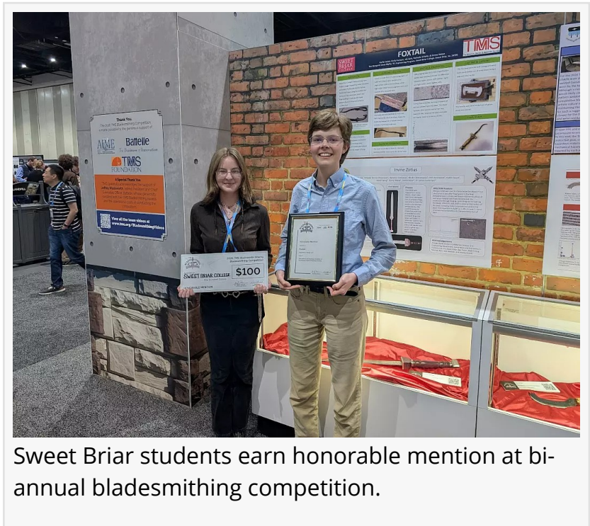
Sweet Briar students earn honorable mention at bi-annual bladesmithing competition.

The 2026 submission is a pattern-welded, Damascus-style blade, nicknamed the “foxtail,” with a sand-cast fox pommel and crossguard, and a pecan-wood handle. Forge-welded, the students