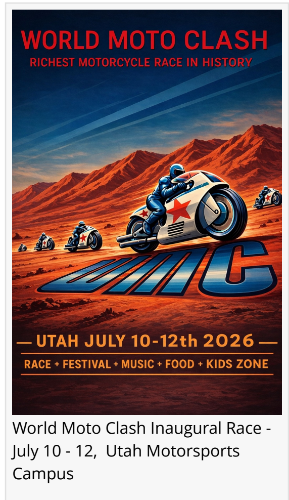
World Moto Clash Inaugural Race - July 10 - 12, Utah Motorsports Campus

Aiming to create a truly international race circuit, WMC is already attracting racers from Europe,