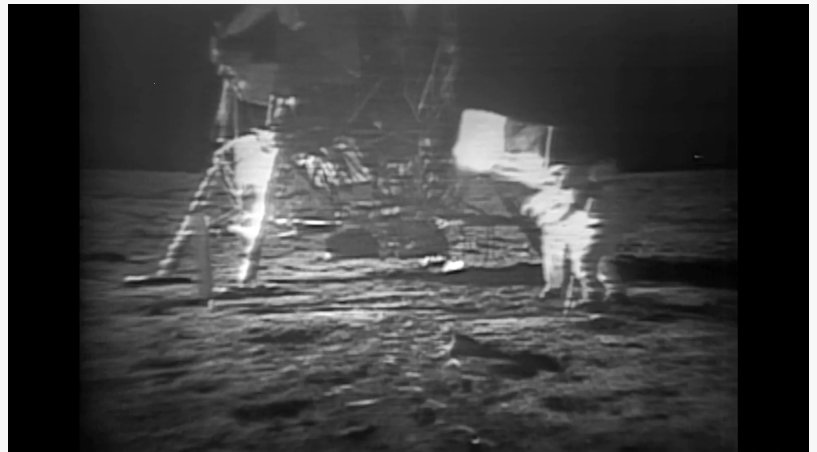
Apollo 11 Moon Landing beamed to the world via Moree NSW Antenna One OTC