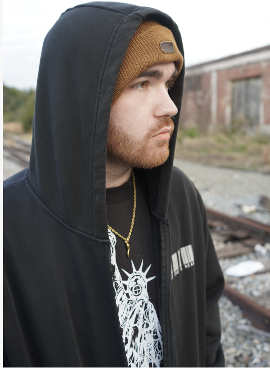
DDK, DMV singer/ songwriter/ producer

Rive Video - Music Video Distribution, Promotion, and PR Rive Music Video Distribution, Promotion, PR +1 908-601-1409 email us here