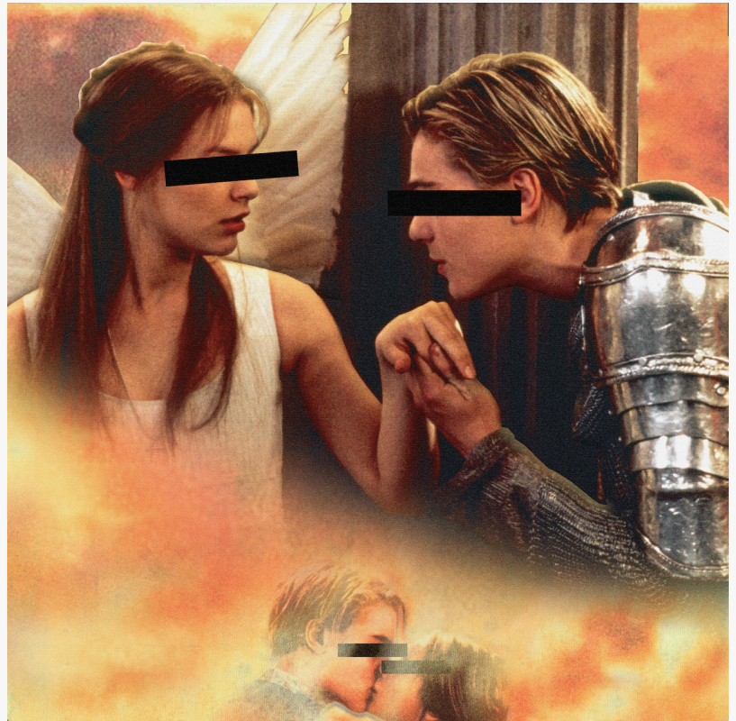
DDK "Fall In Luv" - single cover artwork