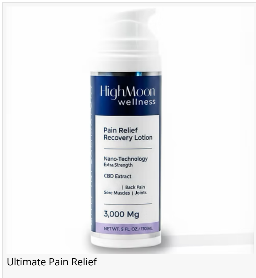
Ultimate Pain Relief

"We built High Moon Wellness around a simple idea: active people deserve a recovery and wellness product that genuinely performs. Launching our secure online store means we can now bring that experience to athletes and everyday consumers across the country, with the transparency, quality, and care they deserve." — High Moon Wellness Founding Team