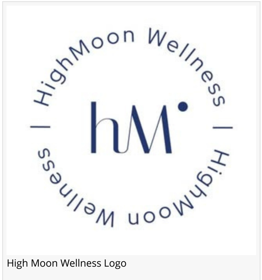
High Moon Wellness Logo

MIAMI, FL, UNITED STATES, April 3, 2026 /EINPresswire.com/ -- High Moon Wellness is proud to announce the official launch of its secure online store, now making its Premium CBD Recovery and Wellness Products available to athletes and active consumers across 42 states. Built for those who take their performance, mobility, and daily wellness seriously, the new storefront delivers the brand's expertly formulated CBD topicals and full-spectrum tinctures directly to customers, backed by a seamless and secure checkout experience. This launch marks a meaningful step forward for a brand that has already earned a perfect 5.0 rating from its growing community of wellness-focused customers.