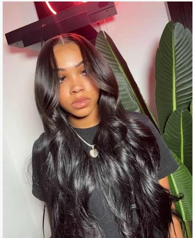
brazilian straight lace frontal wig