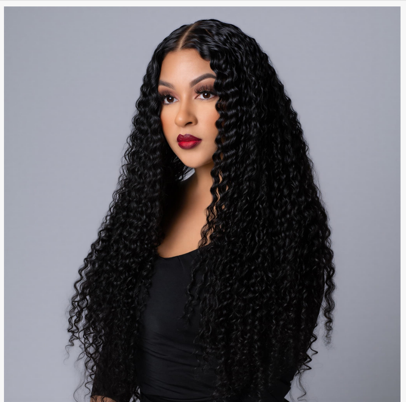
hair wigs for black women

Hair to Waist Xtensions is an online based provider of human hair wigs and lace frontal products. The company is based in Tallahassee, Florida. It offers a range of textured and straight styles designed for daily use. The focus remains on natural appearance and easy