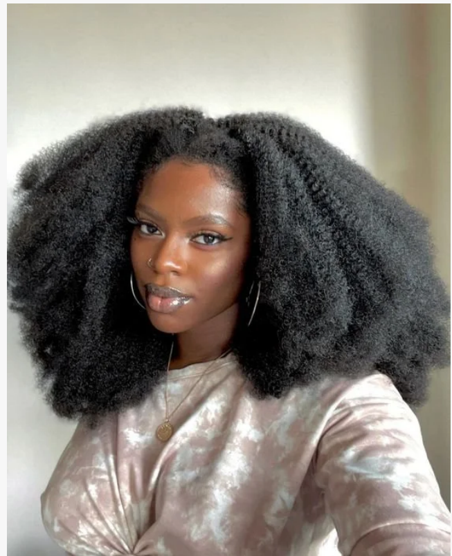
afro kinky curly hair lace frontal,

Online shopping has made it easier to access wig products. Hair to Waist Xtensions operates