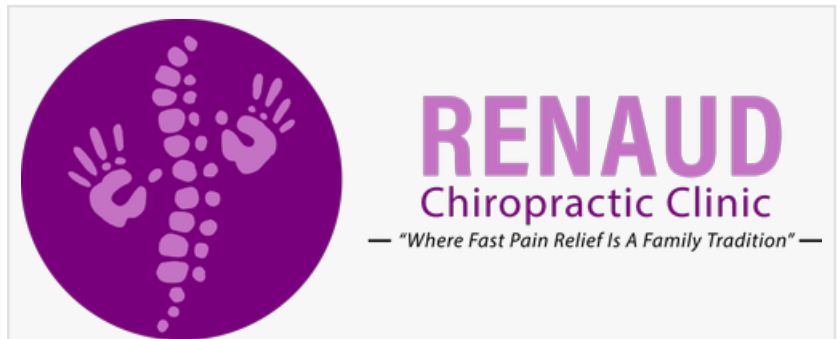
Renaud Chiropractic Clinic