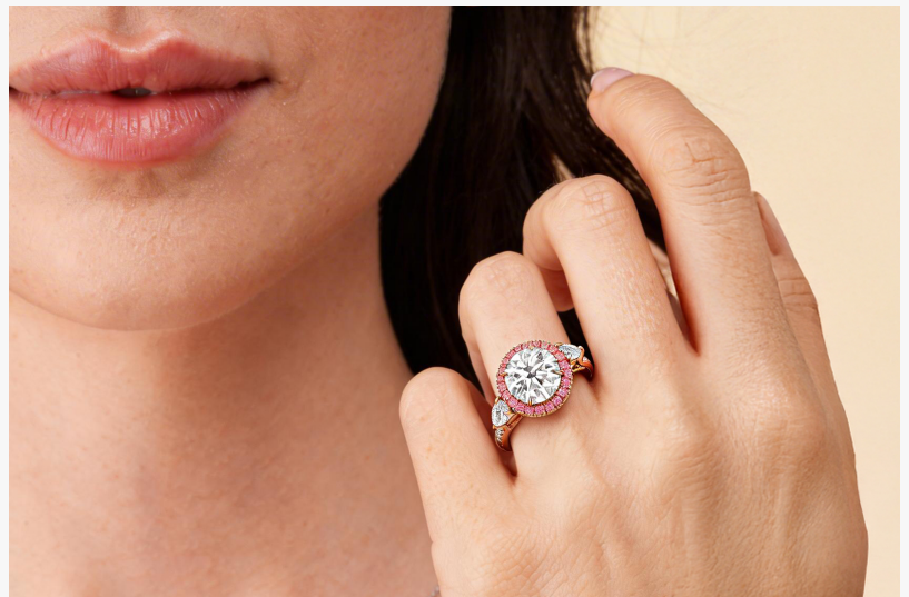
Girl wearing with clarity's pink accent diamond engagement ring