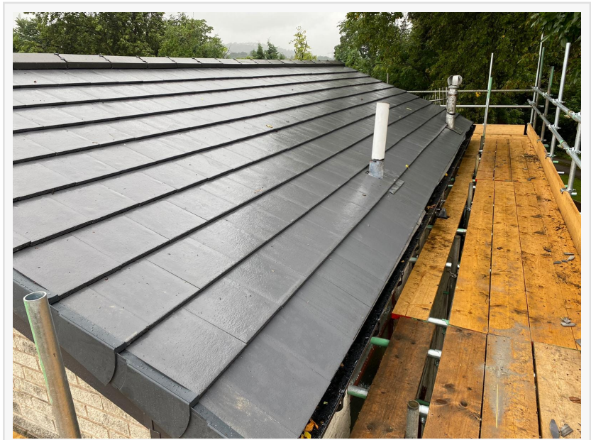
New roof with scaffolding

“Ranking in Google Maps isn’t optional anymore,” the spokesperson adds. “It’s where buying decisions are made within seconds.”