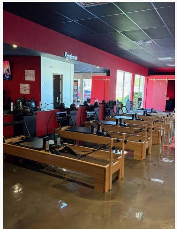
Red Light Method Tulsa Pilates