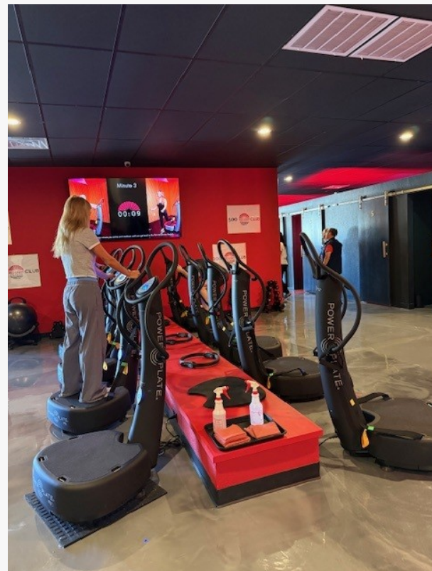
Tulsa Power Plate