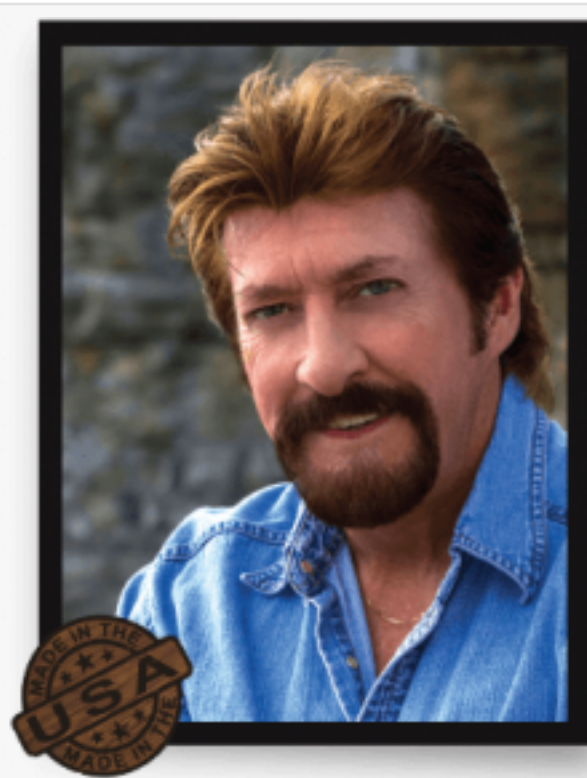
commercial voice over services..

The report explains that voice artists often adjust their delivery based on audience expectations. For example, a corporate narration may require a calm and steady tone, while a promotional spot may demand energy and urgency. These variations ensure that each message fits its purpose and platform.