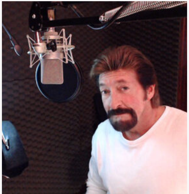
narration voice over service.