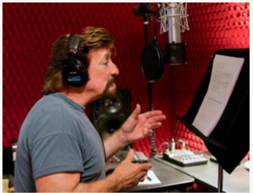
character voice over services.

/EINPresswire.com/ -- Rick Lance Studio has released a detailed press note examining how the human voice shapes modern advertising beyond written scripts. The report highlights how vocal tone, pacing, and delivery influence audience perception. It presents a closer look at how voiceover work turns simple messaging into meaningful communication across commercial, corporate, and entertainment platforms.